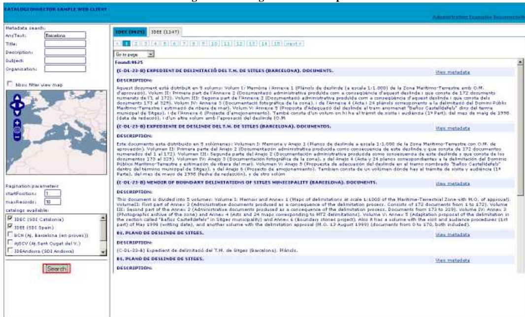
Figure 2. CatalogConnector sample client

→To test catalogConnector go to http://yourdomain/CatalogConnector/index.html